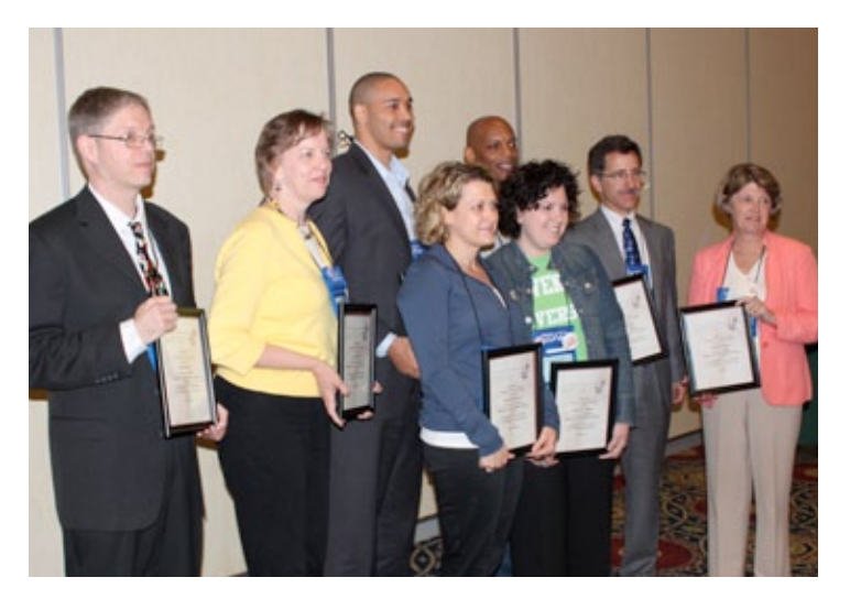
The 2010 Counselor of the Year Award recipients during the Spring Conference.

Potomac and Chesapeake ACAC presents ten Counselor of the Year Awards during our annual spring conference. The award honors one school counselor and one college counselor from each state within our region, as well as the District of Columbia. The award recognizes the hard work and dedication that goes into our profession and sense of accomplishment for a job well done. Congratulations to the following PCACAC Counselor of the Year 2010 recipients: